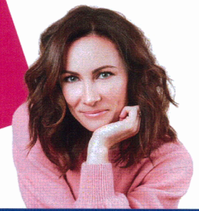
LAURA BENANTI "Glamorously witty" Tony Award® Winner